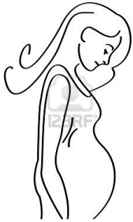
Protect your unborn baby